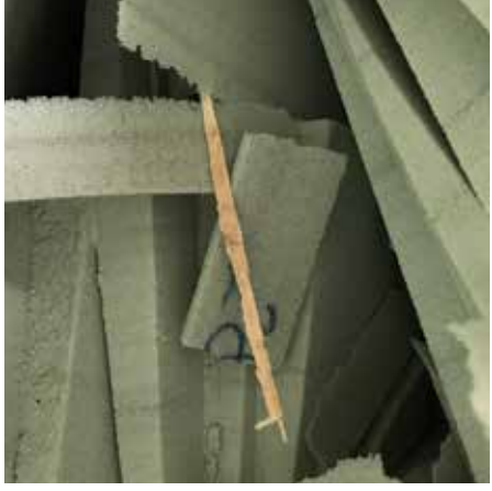
foam other than PET type