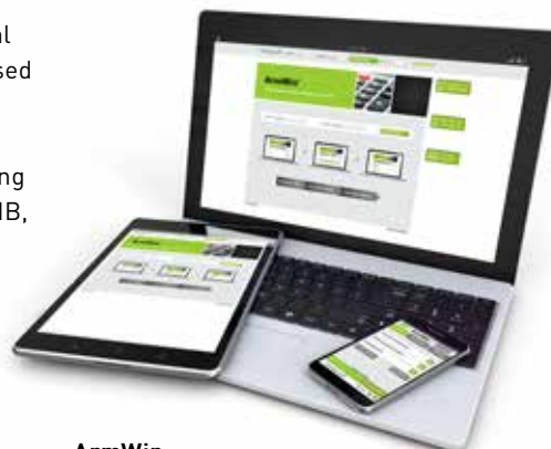
ArmWin All technical insulation calculations in one tool.

With our powerful ArmWin software you can carry out all common technical calculations in HVAC applications - even on the building site, thanks to the app. You can easily determine not only the minimum insulation thickness required for condensation control, but also surface temperature, heat flow, temperature changes in flowing and stationary media, freezing times for water pipes and the most economical insulation thicknesses, i.e. those with the shortest pay-back periods.