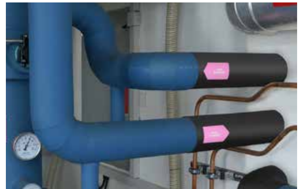
The unique ArmaFlex Protect fire protection solution ensures effective thermal insulation, reliable condensation control and structure-borne noise reduction in a single product.