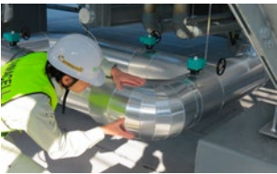
Resistant to deformation