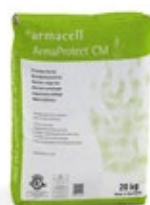
ArmaProtect CM Firestop mortar