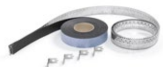
ArmaProtect EFC1 & EFC2 Endless firestop collar