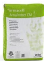
ArmaProtect CM Firestop mortar