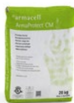
ArmaProtect CM Firestop mortar